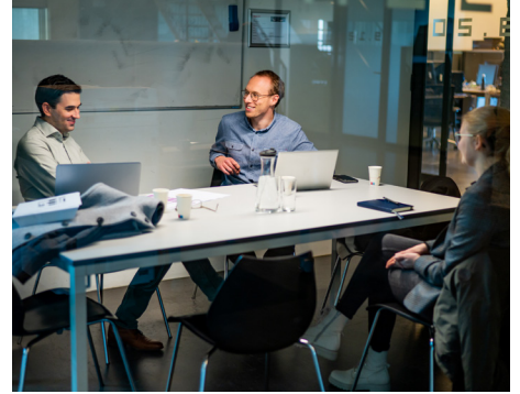
Impression of the 1-on-1 Interviews

As in other years, we will also give the company the possibility to talk with students individually. These 15-minute conversations will take place on the 4th of October 2023 from 8:45am to 12:30pm. This morning offers a unique chance to talk with the students, that are selected by you based on their CV's, about your company and the career possibilities for the student. The morning will consist of ten rounds of conversation prior to the Career Market. If there is a need for more conversations, then there is a possibility to reserve another room, provided that enough students have signed up for this.