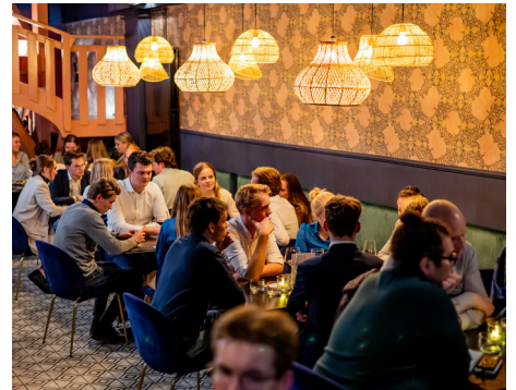
Impression of the Company Dinner

During the Company Dinner, companies and students get the chance to get in contact with each other in an informal way. The Dinner will consist of a three-course menu where students will switch tables after every course. Per course, a maximum of 4 students will be sitting together with your company. The Company Dinner will take place in the evening on the 11th of October 2023.